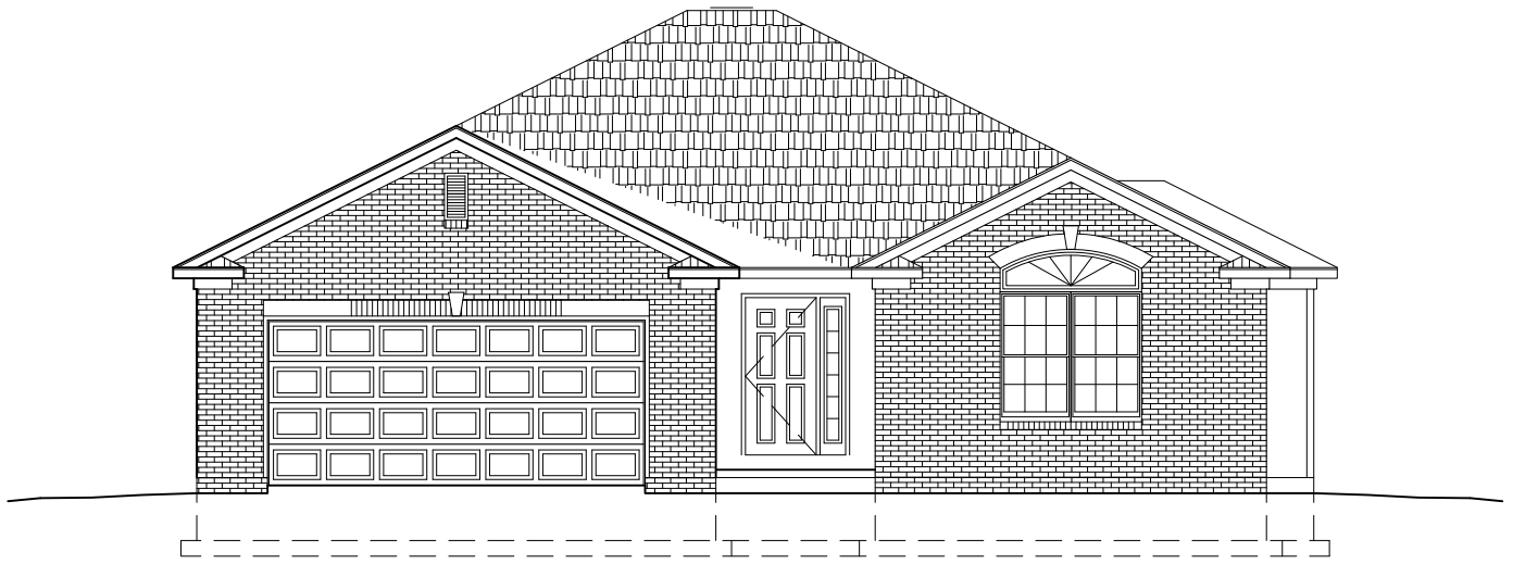
1 FRONT ELEVATION A-1